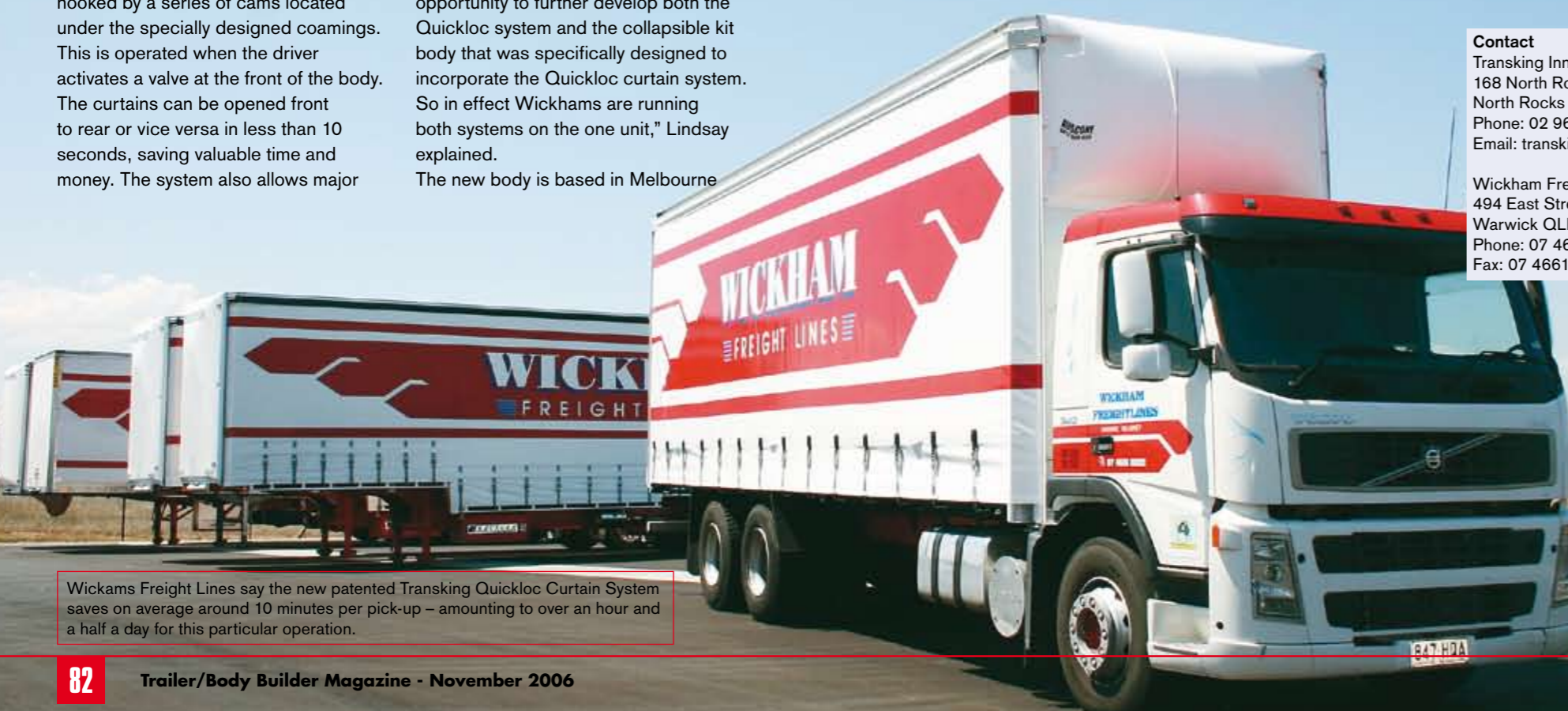
Wickhams Freight Lines say the new patented Transking Quickloc Curtain System saves on average around 10 minutes per pick-up - amounting to over an hour and a half a day for this particular operation.

Wickham Freight Lines 494 East Street, Warwick QLD 4370 Phone: 07 4661 8922 Fax: 07 4661 8602